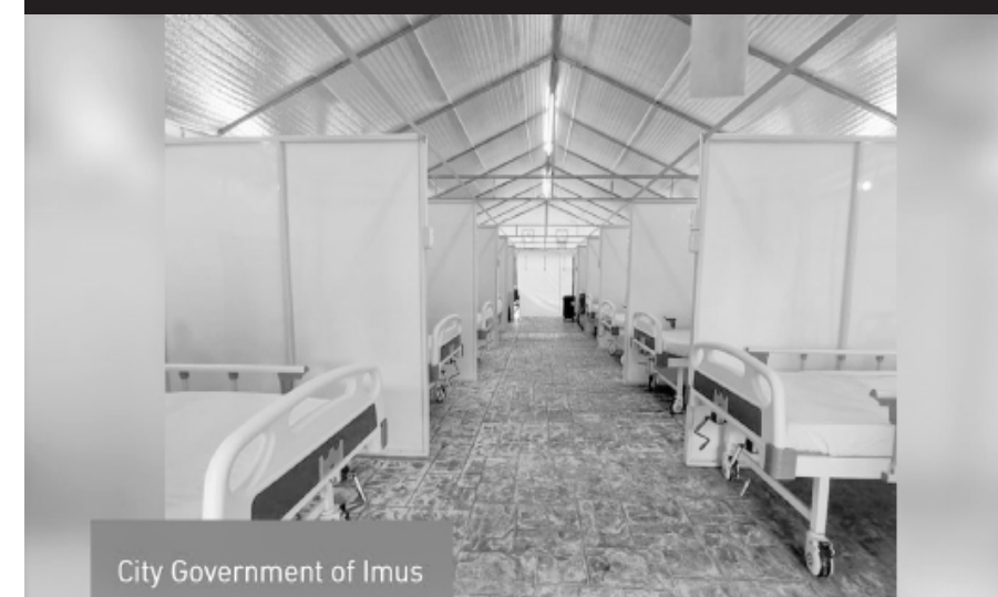
City Government of Imus